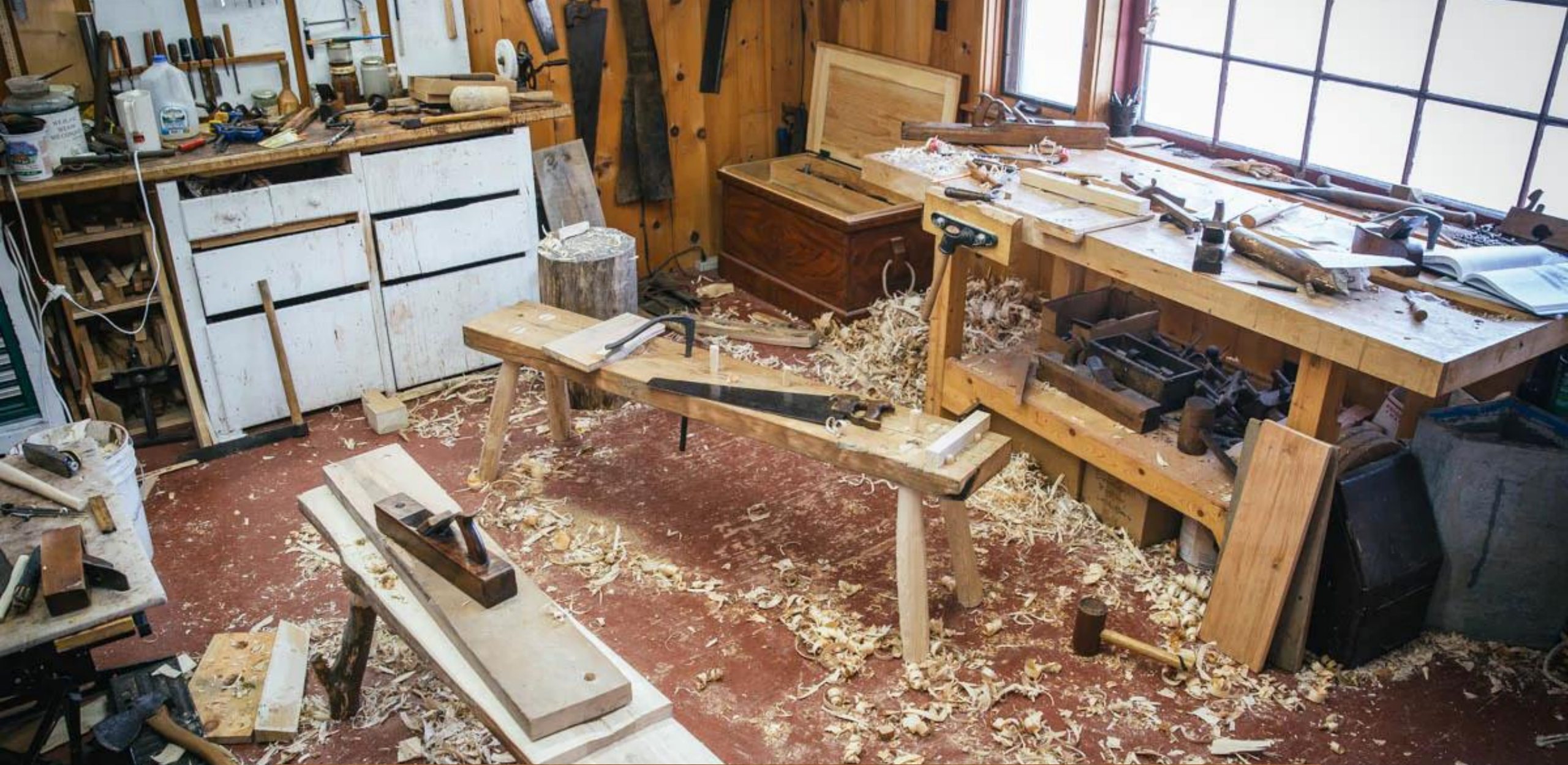
Active Site: Destroyed Workbench