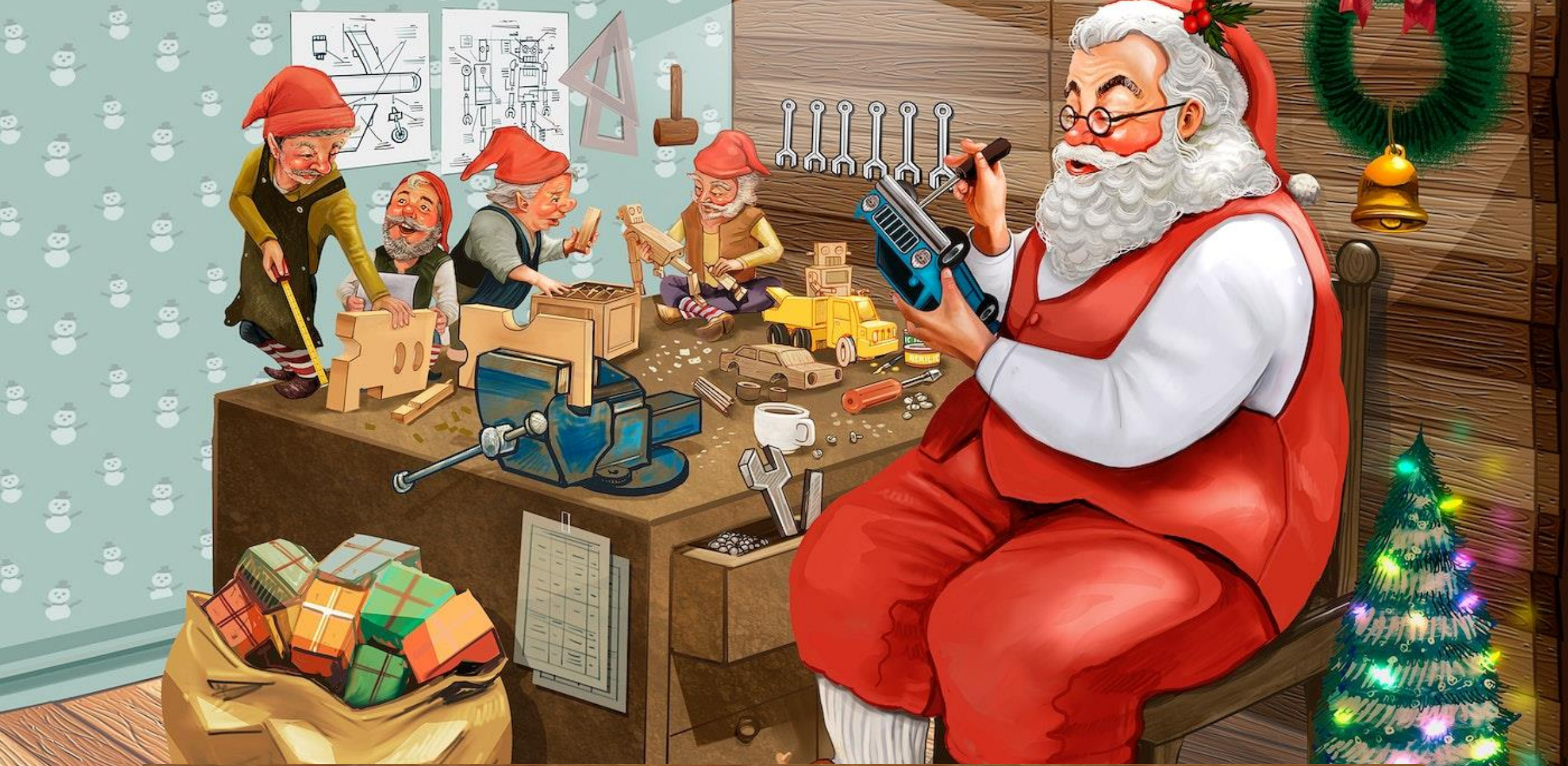
Enzyme Substrate Complex : Building Toys